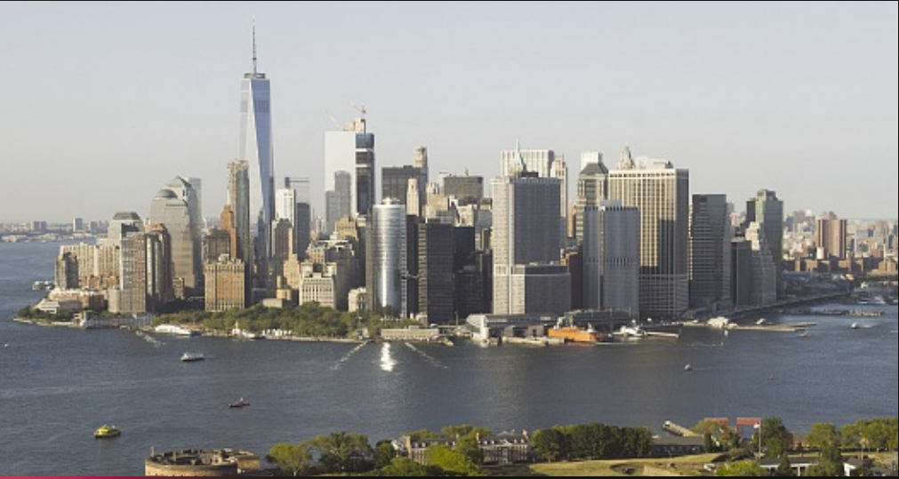
Top of the heap: New York attracted the most FDI projects between 2012 and 2016, and boasts the highest GDP in the rankings

NEW YORK HAS ONCE AGAIN BEEN NAMED fDi 'S AMERICAN CITY OF THE FUTURE, TOPPING THE 2017/18 RANKINGS, WHILE SAN FRANCISCO HAS HELD ON TO ITS SECOND POSITION WITH HOUSTON THIRD. MEANWHILE, CANADIAN CITIES HAVE SHOWN MOST NOTABLE MOVEMENT IN THE LIST, AS CATHY MULLAN REPORTS