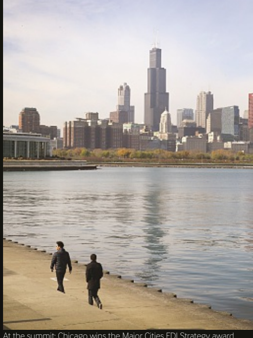
At the summit: Chicago wins the Major Cities FDI Strategy award